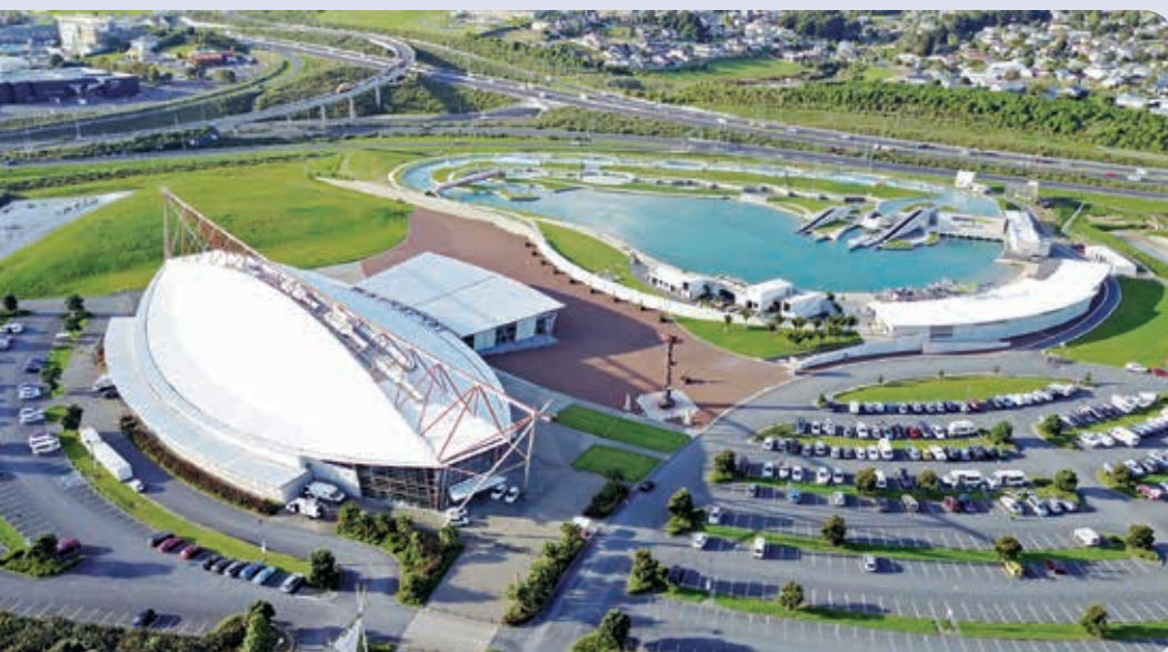
From a swampy paddock where cows grazed to an international destination